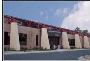
Savannah Technical College Auto/Industrial Tech