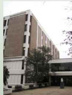
UGA's Boyd Grad. Studies and Science Library