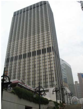
GBA 2 Peachtree St